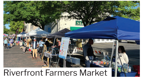
Riverfront Farmers Market