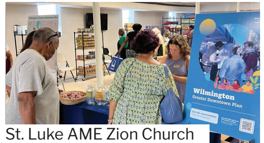
St. Luke AME Zion Church