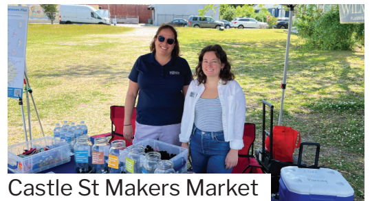
Castle St Makers Market