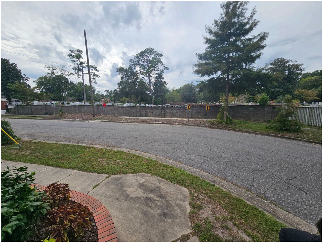
Picture 1 - Existing cinder block wall