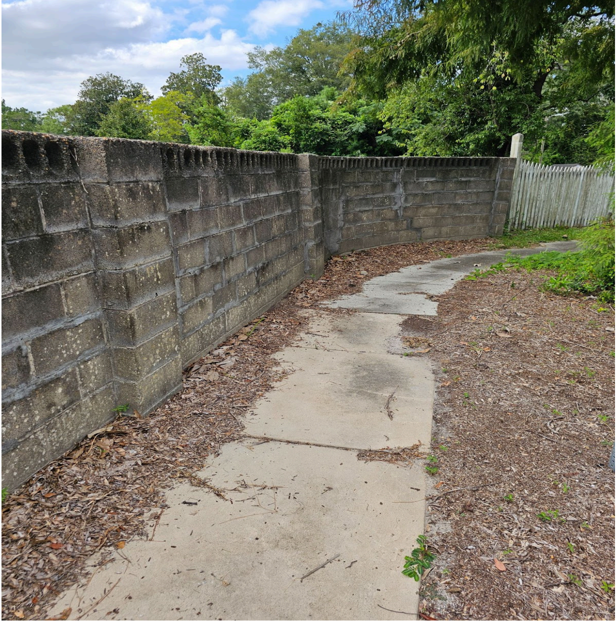
Picture 2 - This wall currently exists inside the cemetery, our proposed new wall will have this same brick, pillars and caps