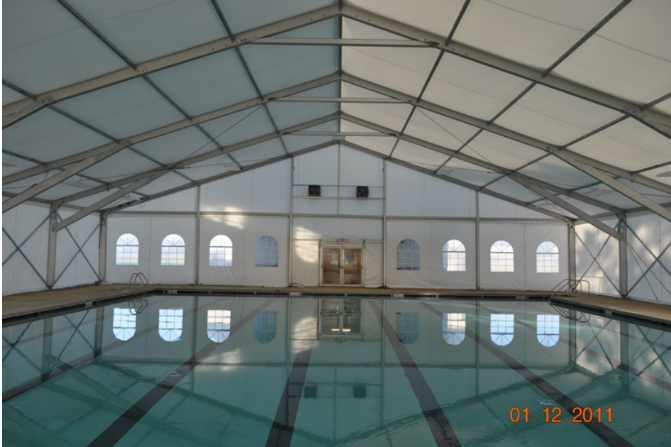
Image 1. Sample photo custom aluminum fabric clad pool cover