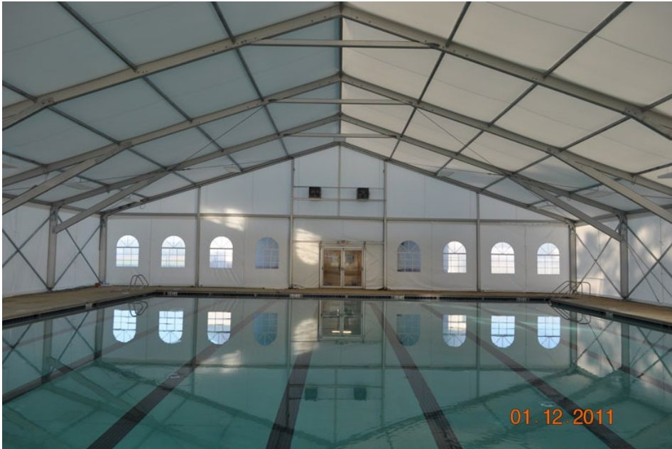
Image 1. Sample photo custom aluminum fabric clad pool cover