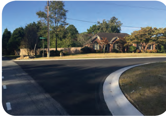
Donald E. Gore Drive

This project involves drainage improvements and the repaving of 2.8 lane miles on portions of Semmes Drive, RL Honeycutt Drive and all of Donald E Gore Drive in the Pine Valley neighborhood. Paving on Donald E. Gore Drive has been completed and the road received drainage improvements earlier this year. Crews are now completing the installation of drainage improvements to portions of Semmes and RL Honeycutt drives, then each road will be paved. The entire project is expected to be complete by the end of the year.