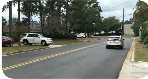
Glen Meade Road

Crews have completed the repaving of Glen Meade Road between Canterwood Road and Marlwood Drive in September. In August, a portion of Medical Center Drive was repaved between 17th Street and Wisteria Drive.