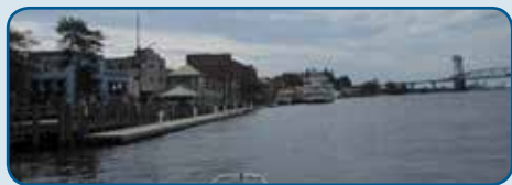
Cape Fear River

(and waterways, not drinking water, within the City limits.)