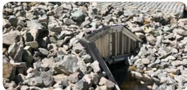
Water flowing through the new culvert under River Road

Failures to underground pipes during Florence's torrential rains caused cave-ins on city streets at more than 70 locations. Most of these repairs involve joint repairs to a pipe beneath the road, followed by patching the road. Over 50 of the repairs are now complete, thanks to a $2.4 million FEMA-reimbursable contract. We expect them all to be complete by this July.