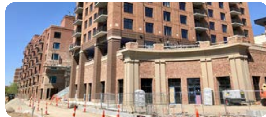
TOP: The River Place mixed-use project BOTTOM: Water Street looking north from Chestnut Street