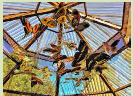
💧 Eco tour field observations