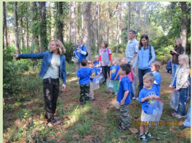
💧 Eco-tour field observations