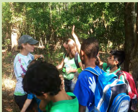
💧 Walking eco-tour of lake