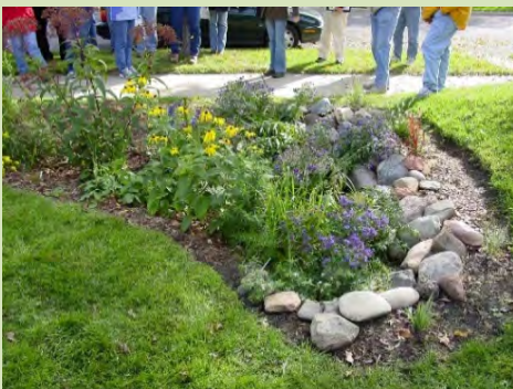
💧 Schoolyard rain garden

The Oyster Education Program connects students to the coast using oysters in the classroom and in the field to create knowledge and awareness about their importance. Dissection activities are correlated to the N.C. Essential Standards to help teachers integrate the program into their courses. High school students are encouraged to join the federation in oyster monitoring at their reefs.