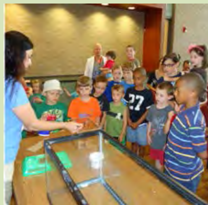
💧 Combination of classroom & hands-on learning