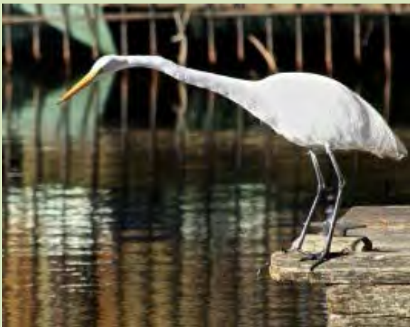
💧 Plant and wildlife identification

These presentations can cover a wide range of topics, and aim to ignite student passion for the natural world. Presentations generally run for 1-hour and are suited to a typical classroom-sized group.