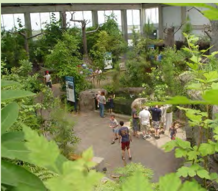
💧 Self-guided tour

School groups can request more in depth animal programs on topics such as sharks, invertebrate, whales, and reptiles. Programs include hands on activities, animal artifacts, and live animals when possible. Appropriate for first grade through university students.