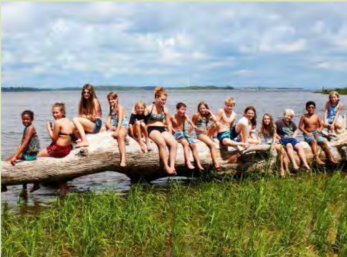
💧 A group of eco-campers

http://www.capefearriverwatch.org/news-events/register-for-the-paddle-series-now