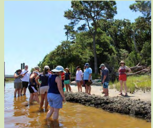
💧 Educating the educators