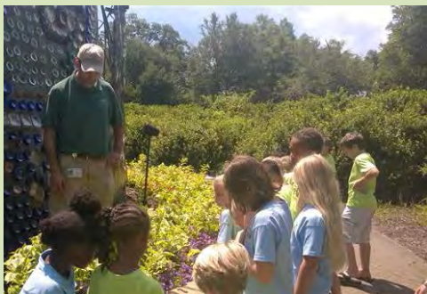
💧 Plant and wildlife identification

This program focuses on the life cycle of butterflies. It is best suited for late summer/early fall, or late spring/early summer so students can get up close and personal with living butterflies in Airlie's 2,700 square foot butterfly house (open seasonally from mid-May through mid-October). Students will view a short slide show, then venture into the garden to look for butterflies, caterpillars, or the plants they use to survive.