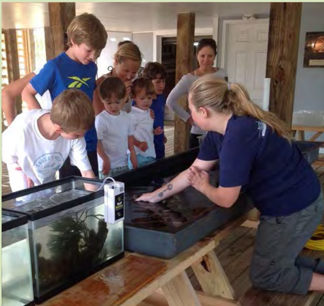
💧 Touch Tank Tuesday

What's better than seeing shells at the beach? Being able to touch, interact and learn about the living creatures inside. From slimy kelps to cute, shy hermit crabs to friendly whelks, our weekly touch tanks will introduce you to some of the most interesting creatures that roam the North Carolina coast.