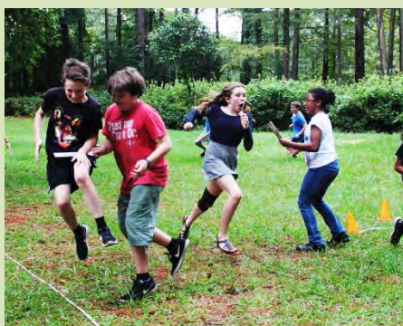
💧 Interactive, physical game

A combination of pre and post classroom visits and a field trip to Greenfield Lake teaches students about the flow of water within watersheds, and the concerns surrounding polluted stormwater runoff. Students will participate in an interactive, physical game to follow the life cycle of a raindrop. Students learn environmental stewardship through hands-on and fun activities.