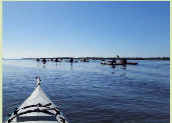
💧 CFRW paddlers on the river