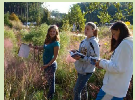
💧 Students studying native plants