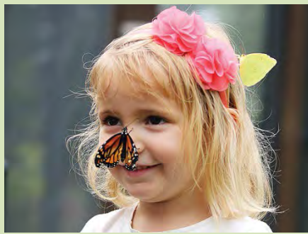
💧 Educational presentation