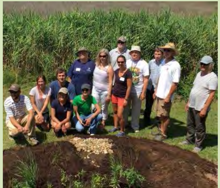
💧 Rain garden constructed by volunteers