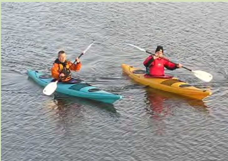
💧 Kayakers on the Black River

Enjoy a Wednesday evening in the park with your family learning about nature. Each week a new theme will be presented. Example themes include bees, snakes of NC, alligators, and more!