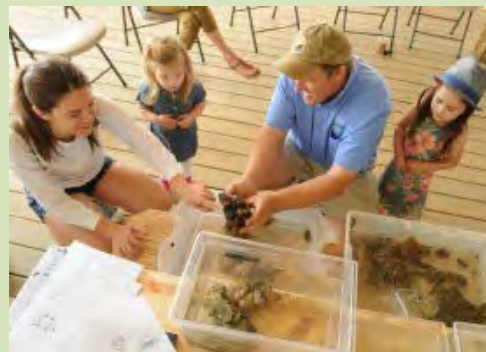
💧 Oyster show and tell