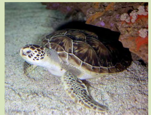
💧 Sea turtle in the aquarium