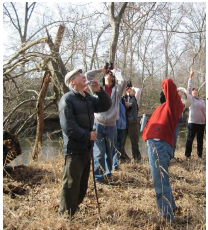
North Carolina Native Plant Society & Wake Audubon

A variety of environmental education workshops are held throughout the year and include Spring Migratory Bird Identification, Birding By Ear, Coastal Wildlife Workshop, Fall Migratory Bird Identification, Black Bear Eco-tour to Pocosin Lakes NWR, Outer Banks Birding Trip and Winter Bird Identification. Other workshops may include Project WET, WILD, Learning Tree and Flying Wild.