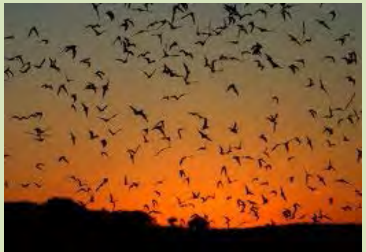
💧 A past Summer Evening Series featuring bats