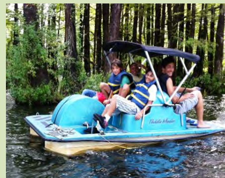
💧 Paddleboat field observations