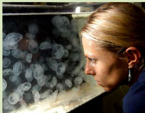
💧 Behind the scenes