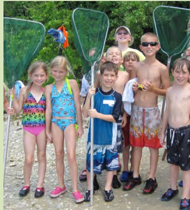
💧 Past summer camp