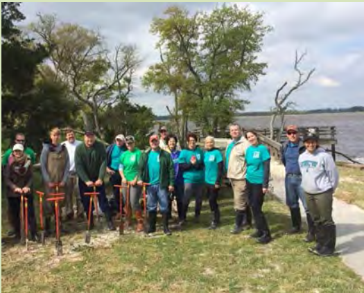
💧 "Community cleanup

Public school teacher training programs serve as opportunities for enriched learning and reinforcement of crucial lessons. The weeklong cross-disciplinary seminars allow teachers from across the state to immerse themselves in a wide range of experiential studies and return to their classrooms recharged with energy and resources. NCCF's educators are experts in teaching about watersheds and the importance of estuaries through hands-on techniques.