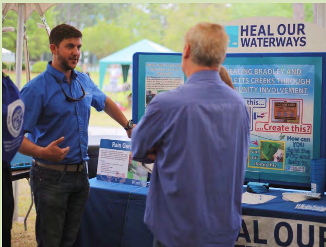
💧 HOW staff at Wilmington's Earth Day Festival

The City of Wilmington Stormwater Services and New Hanover Soil & Water Conservation District partner to bring discounted rain barrels to the public. Benefits of installing a rain barrel include reducing stormwater runoff, collecting free water all year long, and reducing your water bill!