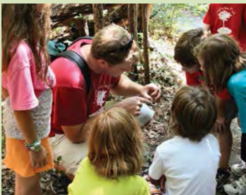
💧 Park Naturalists lead nature programs

Students will discuss familiar shapes and colors and compare them with the shapes and colors found in nature. The activity will start with a trail walk to explore the world of the outdoors to discover shapes and colors in plants, rocks, leaves, trees and logs. The lesson concludes with a review of the walk and the objects, shapes and colors that students found.