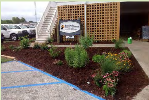
💧 Native Plant Garden at the Stanback Coastal Education Center

Join the federation to pull seine nets or toss cast nets and see some of the amazing animals that call our local waters home! Students will be amazed at the great diversity of creatures in our creeks and bays! Younger students pull nets, explore the diversity of the salt marsh, play salt marsh games and do a scavenger hunt. Older students perform water quality testing and learn how to identify coastal species, in addition to other activities.