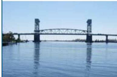
Cape Fear River

www.uncw.edu/cmsr/aquaticecology/laboratory/