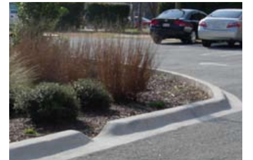
Stormwater runoff flows from a parking lot into a rain garden.

Stormwater runoff is water from rain or irrigation that flows over land and into creeks, lakes, and larger waterways. Impervious (hard) surfaces, such as driveways, streets, parking lots, and rooftops, prevent stormwater runoff from naturally soaking into the ground. Instead, it picks up and transports pollutants such as pet waste, fertilizers, pesticides, auto fluids, yard debris, heavy metals, and litter through the drainage system and flows directly into our waterways. Stormwater runoff is the number one source of surface water pollution.