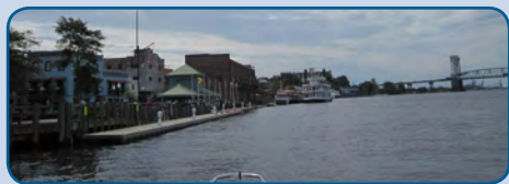
Cape Fear River

(and waterways, not drinking water, within the City limits.)