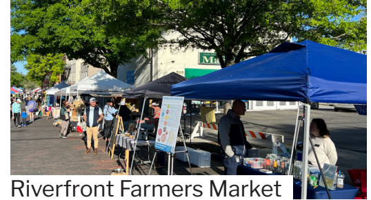
Riverfront Farmers Market