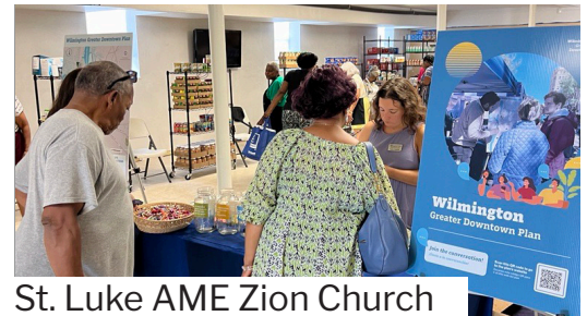
St. Luke AME Zion Church