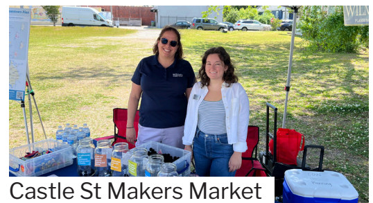
Castle St Makers Market